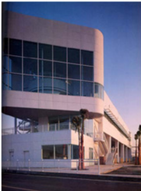
View from Terminal